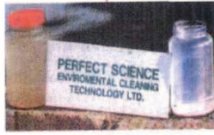
Suyun doğadaki ilk haline dönüştürülmesi

Our company very much wishes to work with your corporation in the field of environmental purification. We look forward to meeting with you to discuss these matters in detail and developing the parameters of specific pilot project research.