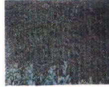
PERFECT SCIENCE TEKNOLOJİSİ ile toprağın verimli hâle getirilmesi