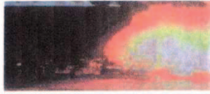
PERFECT SCIENCE TEKNOLOJİSİ ile yangına müdahale