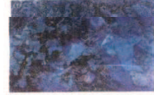
Çöplerin kirliliğinin engellenmesi PERFECT SCIENCE TEKNOLOJİSİ ile gerçekleştirilmiştir